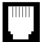
Fig 1: Pin Numbers for Serial Interface Connector 1 — 6